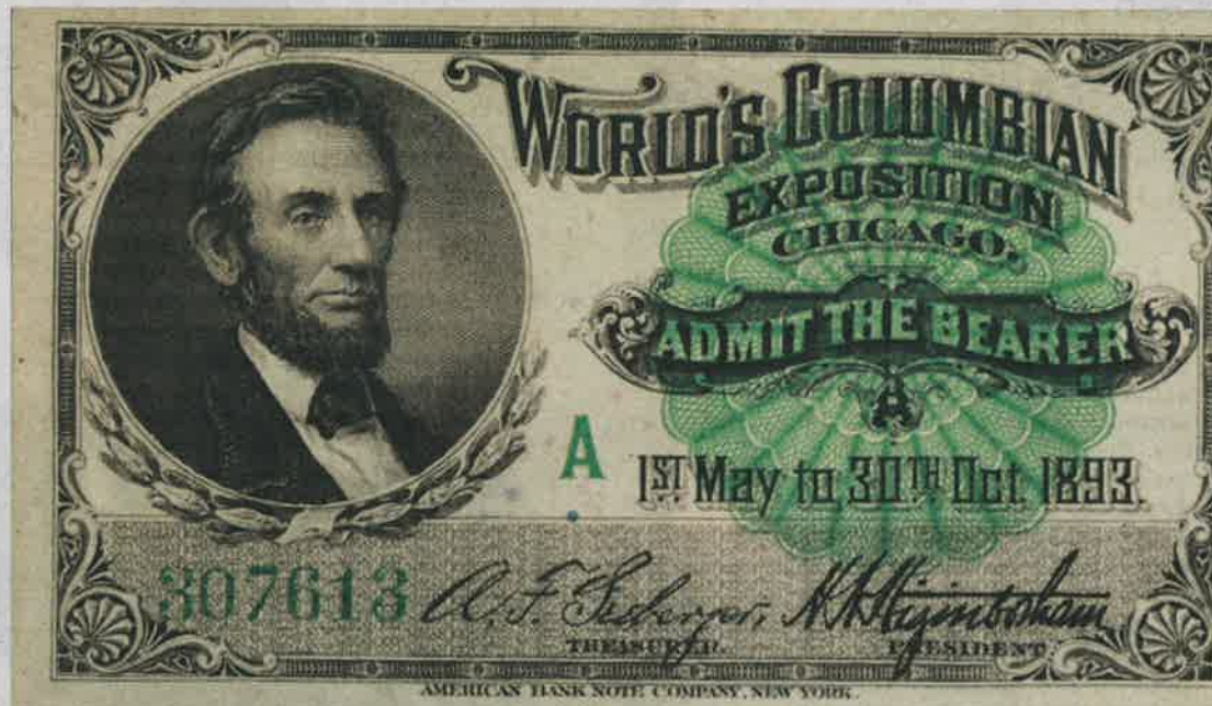
LEFT: An admission ticket bearing the likeness of Abraham Lincoln is among the ephemera comprising "Pictures from an Exposition: Visualizing the 1893 World's Fair," Sept. 28-Dec. 31, at the Newberry Library.

Sept. 27-30, Navy Pier's Festival Hall, 600 E. Grand ( expochicago.com ), SOFA CHICAGO, Nov. 1-4, Navy Pier's Festival Hall ( sofaexpo.com ). These two fairs are an annual staple of the fall scene. Back for its seventh year, Expo Chicago has established itself as an essential stop on the international contemporary art circuit. This year's edition will feature 135 top galleries from 63 cities around the world. Focusing on sculpture and what it calls functional art and design, SOFA is marking its 25th anniversary.